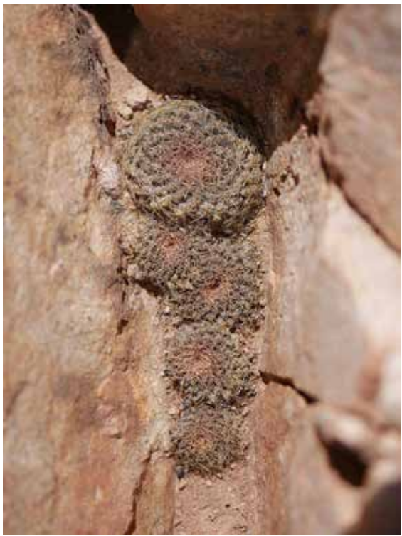
Copiapoa humilis subspecies tenuissima blending with their surroundings

Other cacti use different strategies to conserve water. They produce more roots when it rains to absorb as much water as they can. When the climate gets dry, their roots will shrivel and even break off to conserve the water they have in their stems. If the