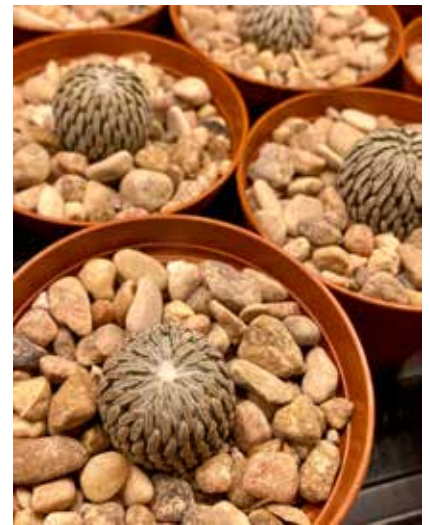
P. aselliformis in cultivation in Houston at Echo's Cacti and Succulents Nursery

The rarity in cultivation, its characteristic tubercles and showy flowers plus the challenge of growing from seed successfully make the woodlouse cactus highly valuable and desirable by cactus collectors.