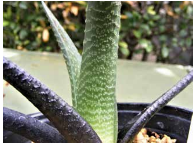
Haworthiopsis limifolia limifolia x Haworthia cooperi venusta : structure of lower leaf surface