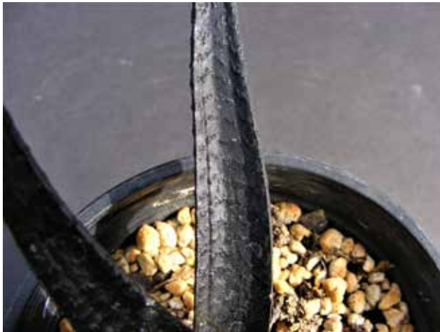
Haworthiopsis limifolia limifolia x Haworthia cooperi venusta : structure of upper surface of the leaves