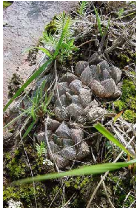
Father plant of Haworthiopsis limifolia limifolia x Haworthia cooperi venusta GM292, H. cooperi venusta.