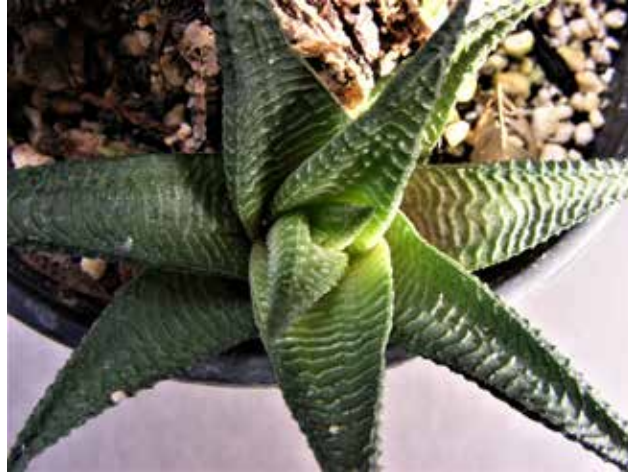
Mother plant of Haworthiopsis limifolia limifolia x Haworthia cooperi venusta GM292, H. limifolia limifolia