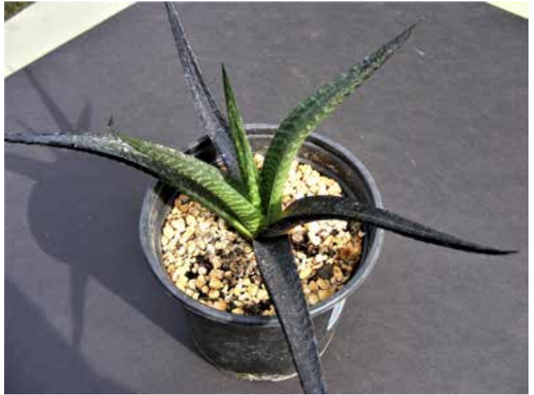
Haworthiopsis limifolia limifolia x Haworthia cooperi venusta GM292