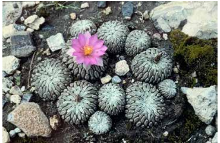
P. aselliformis in habitat

Origin and Habitat: Pelecyphora aselliformis is a cactus originated in San Luis Potosí, Mexico. The name comes from Greek “ pelekus ”, which means hatchet. “ Phoros ” means bearing, referring to the shape of the cactus tubercles. The species name “ aselliformis ” describes the