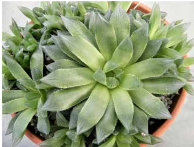
Haworthia cooperi venusta x H. limifolia