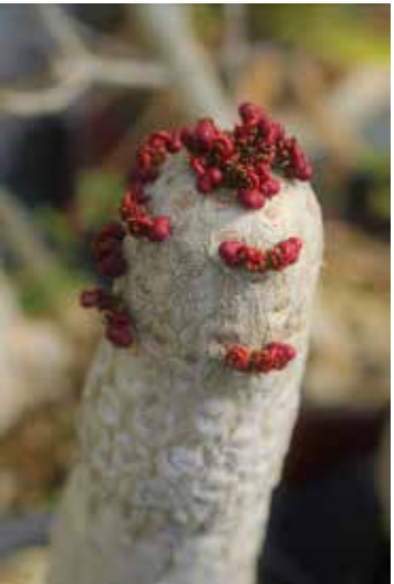
E. unispina Fruit