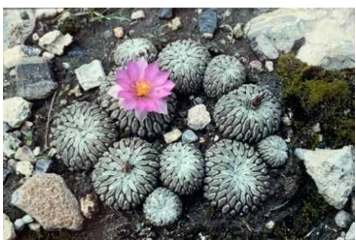
P. aselliformis in habitat

Origin and Habitat: Pelecyphora aselliformis is a cactus originated in San Luis Potosí, Mexico. The name comes from Greek "pelekus", which means hatchet. "Phoros" means bearing, referring to the shape of the cactus tubercles. The species name "aselliformis" describes the