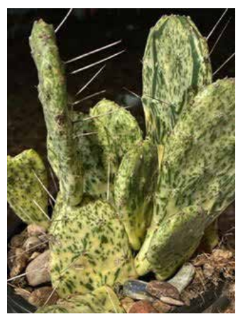
to early summer.

ic to humans and pets. While it is easier to handle because glochids are spaced out and the spines are clearly visible, caution should still be used. To keep the vibrant variegation, full sun for at least 5 hours is optimal. However, it will also do well with partial shade. Vibrant pink to red flowers will appear in late spring