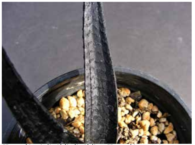
Haworthiopsis limifolia limifolia x Haworthia cooperi venusta: structure of upper surface of the leaves