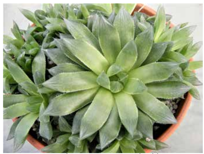
Haworthia cooperi venusta x H. limifolia