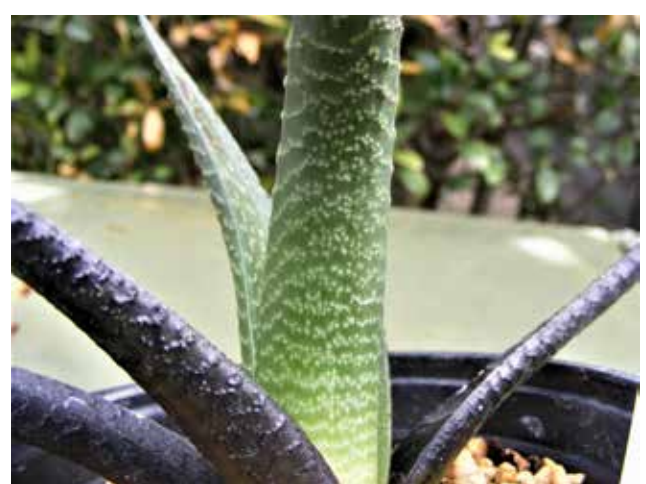
Haworthiopsis limifolia limifolia x Haworthia cooperi venusta: structure of lower leaf surface