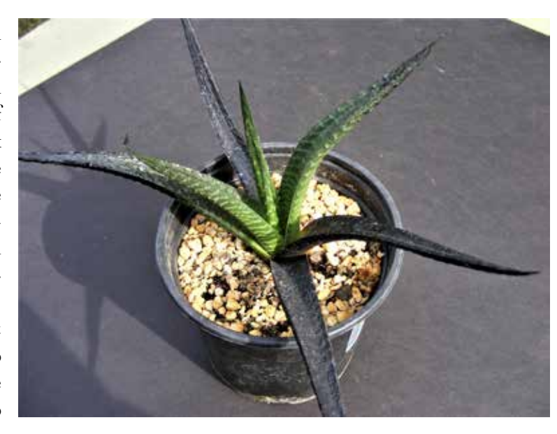
Haworthiopsis limifolia limifolia x Haworthia cooperi venusta GM292