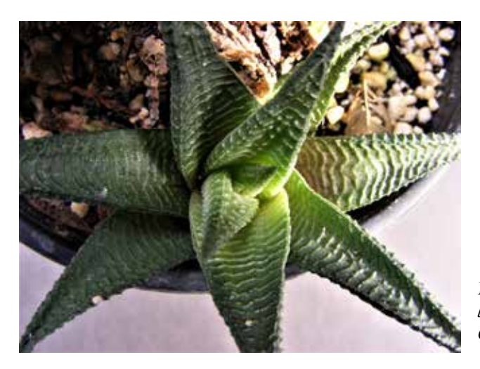
Mother plant of Haworthiopsis limifolia limifolia x Haworthia cooperi venusta GM292, H. limifolia limifolia