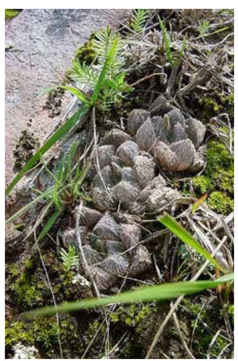
Father plant of Haworthiopsis limifolia limifolia x Haworthia cooperi venusta GM292, H. cooperi venusta.