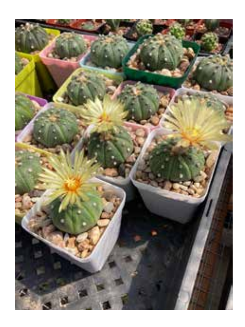
Similar appearance of Euphorbia obesa and Astrophytum asterias.