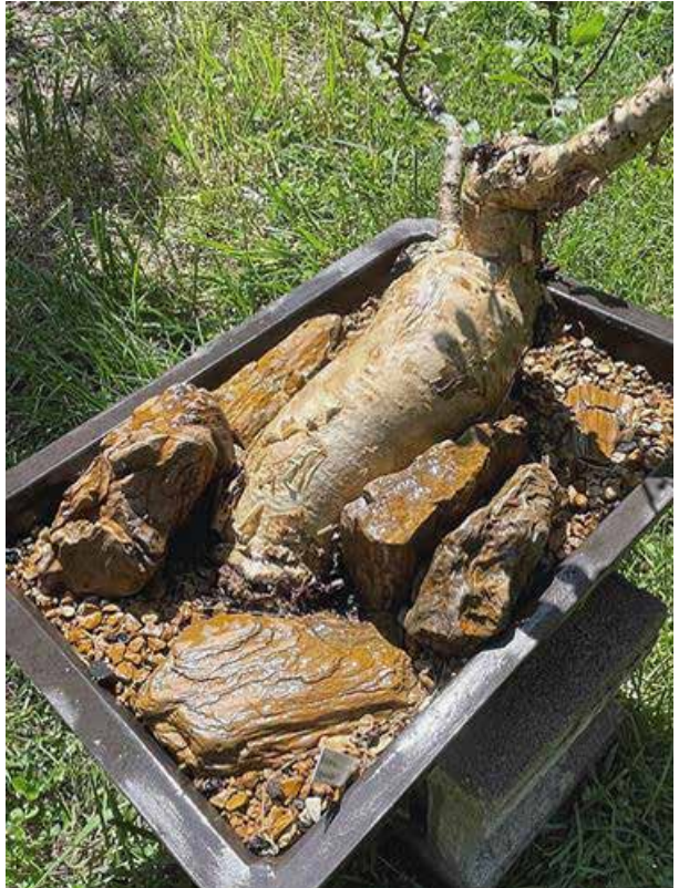
This succulent tree is highly trimmed and staged with petrified wood.

There are temperamental, "difficult" plants, but those tags usually mean you really need to educate yourself about the plants and how they grow in habitat to determine their needs. Find out what wiggle room you have to adjust any certain parameter to accomplish your goal for a plant.