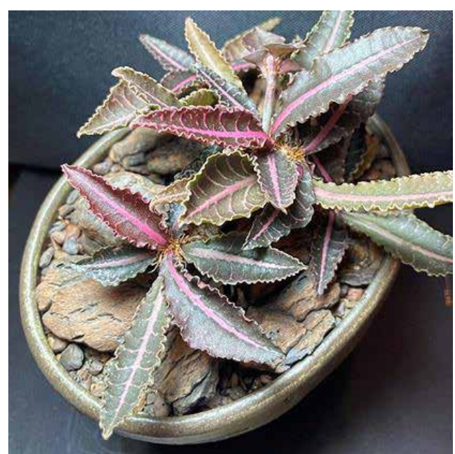
Try staging plants in different pots and orientations.

From that time and continuing for eight to 10 years, I continued to grow my collection and ultimately built a greenhouse. During that time, I grew most of my plants well. Well ... I kept most of my plants alive and grew some of them well.