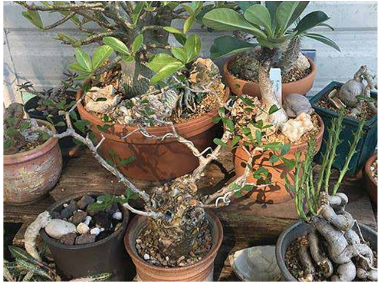
Don't be afraid to manipulate your plants by altering how the roots grow, or trimming and wiring to achieve a certain look.

I told her about my entire collection being swiped that very morning, and she told me I should join the cactus society to which her grandmother belonged. Maybe the society members could help me rebuild my collection. As I write this, it occurs to me that I never found out who her grandmother was or thanked that young lady for informing me about our local society.